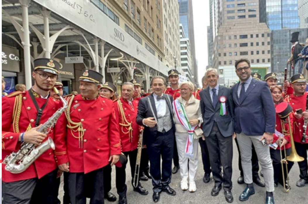
Here and on the previous page, some images of Italea's participation in the Columbus Day Parade