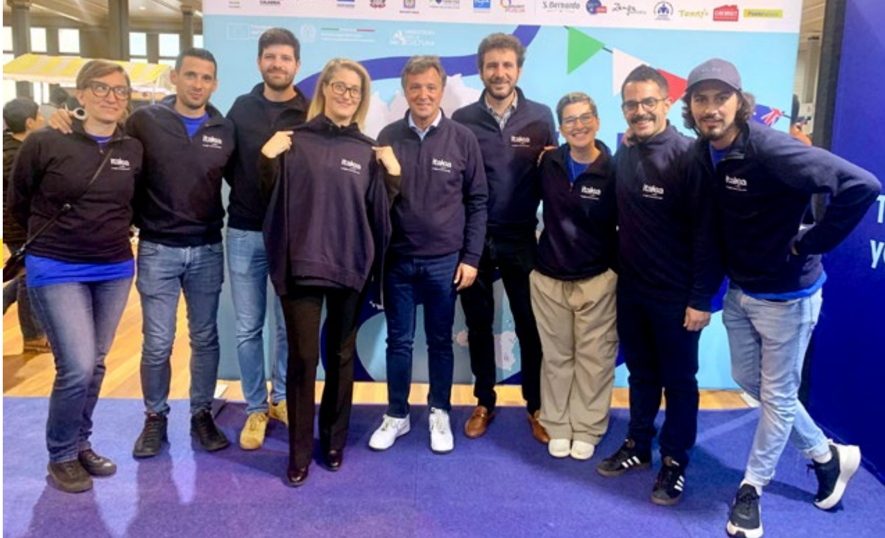
The Italea team with the Consul of Italy in Melbourne, Chiara Mauri